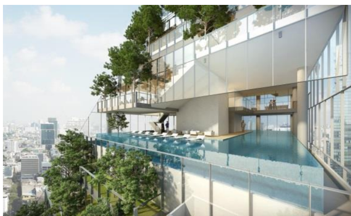
CG Rendering (common area)