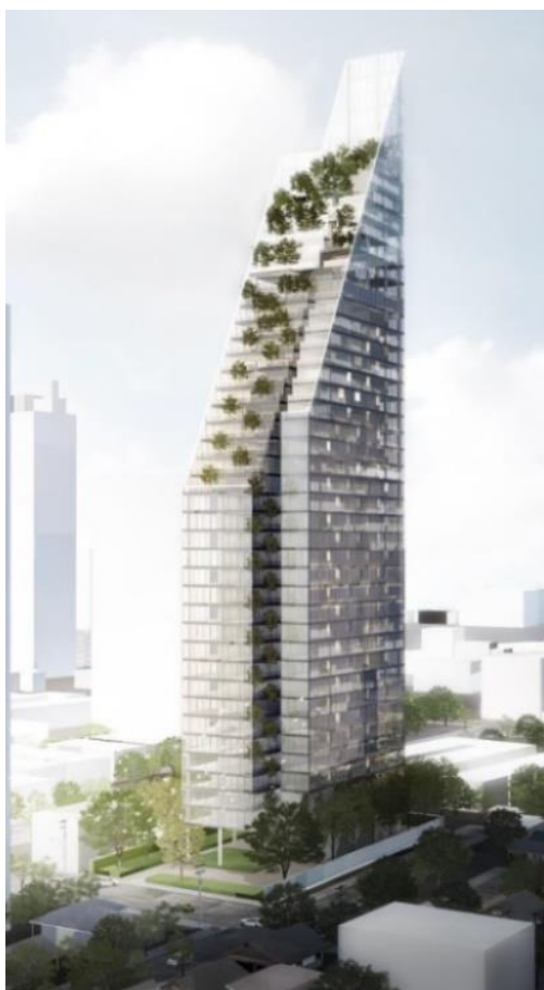
CG Rendering (exterior)