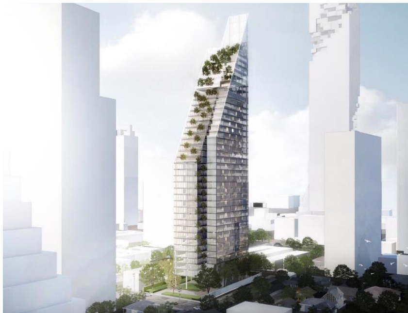
CG Rendering of Sathorn Project

Raimon Land, which will be the business partner, is a local developer established in 1987. The company develops high-quality products with refined design targeting the upper middle class mainly in the metropolitan area and is well-received in Thailand.