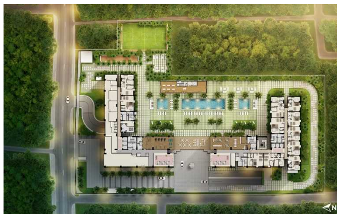
CG rendering (site plan)

The Loggia project *The details of the project are as of the current date and may change in the future.