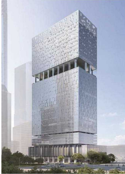
CG Rendering of CPF Building Redevelopment Project (Singapore)