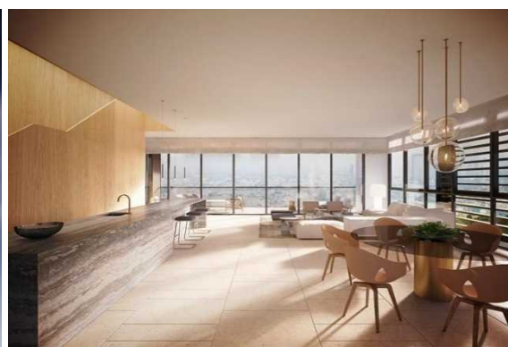
CG rendering (residence interior)