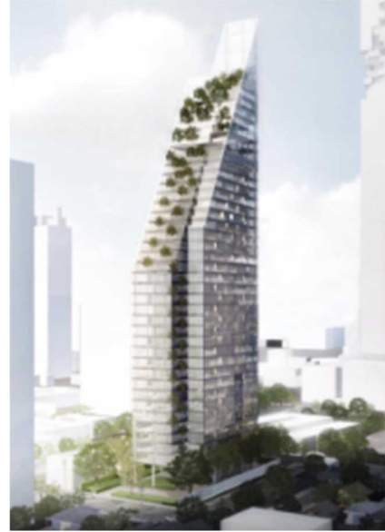
CG Rendering of Sathorn Project (Bangkok, Thailand)