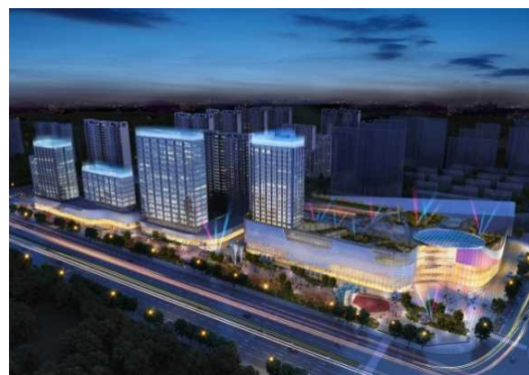
CG Rendering of Xuzhou Project (Xuzhou, China)