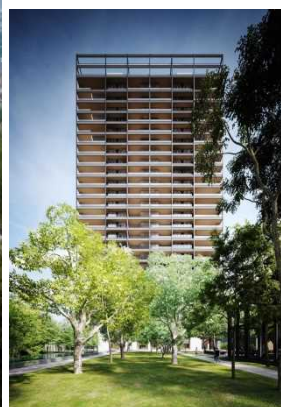
CG rendering (residence exterior)