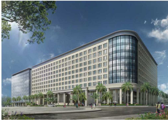
CG Rendering of Former Site of Yangon Military Museum Redevelopment (Yangon, Myanmar)