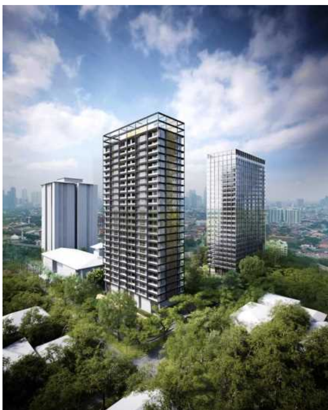
CG rendering (entire project)

CG Rendering of Dharmawangsa Project (tentative) *The details of the project are as of the current date and may change in the future.