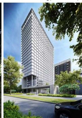
CG rendering (office building exterior)