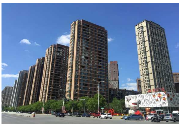
Shenyang Tomorrow Square Project (Shenyang, China) Partly Completed