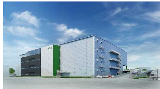
<Perspective Drawing of the Expected Image of (Tentative Name) T-LOGI Narashino>

Address: 2-1-92, Shibazono, Narashino-shi (lot number) Access: Approx. 2.9 kilometers from Yatsu Funabashi IC of the Higashi Kanto Expressway A 17-minute walk from Shin-Narashino Station on the JR Keiyo Line Site area: Approx. 14,008 m 2 (planned) Floor area: Approx. 33,557 m 2 (planned) Structure/ Floors: Steel-framed structure/4 floors above ground (planned) Opening: Around spring 2022 (planned)