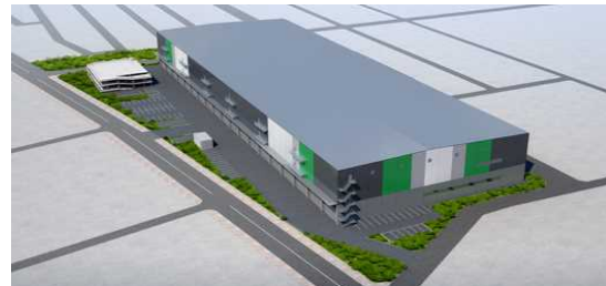
<Perspective Drawing of the Expected Image of (Tentative Name) T-LOGI Musashi-Hikida>

Access: Approx. 2.5 kilometers from Hinode IC of the Ken-O Expressway A 6-minute walk from Musashi-Hikida Station on the JR Itsukaichi Line Site area: Approx. 28,216 m 2 (planned)