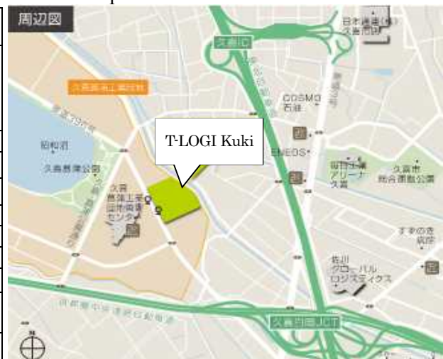
<Location Map of T-LOGI Kuki>