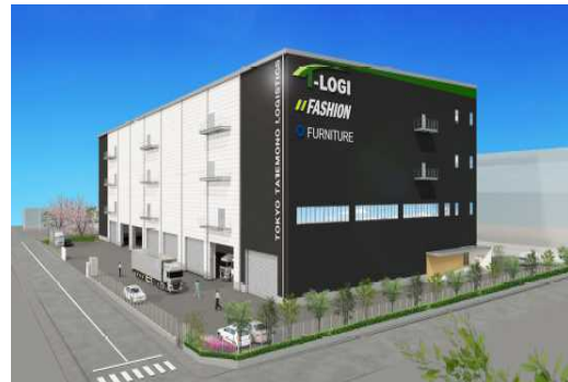
<Perspective Drawing of the Expected Image of (Tentative Name) T-LOGI Yokohama-Aoba>

Address: 654-1, Aza-Gikoba, Kawawa-cho, Tsuzuki-ku, Yokohama-shi, Kanagawa (lot number) Access: Approx. 3.0 kilometers from Yokohama Aoba IC of Tomei Expressway Approx. 4.6 kilometers from Kohoku IC of Daisan Keihin Road A 10-minute walk from Kawawacho Station on the Yokohama Municipal Subway Green Line Site area: Approx. 7,793.06 m 2 (planned) Floor area: Approx. 17,068 m 2 (planned) Structure/ Floors: Steel-framed structure/4 floors above ground (planned) Opening: Around spring 2022 (planned)