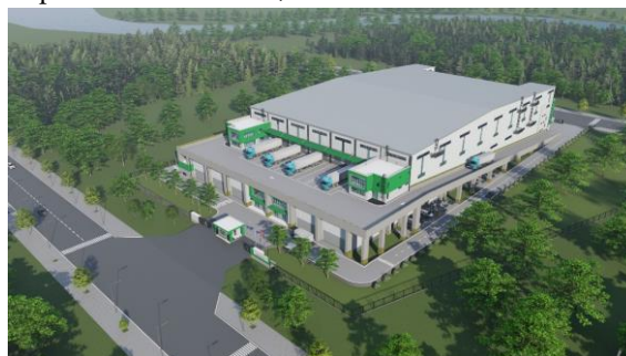
External view of the warehouse