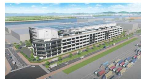
▲ T-LOGI Fukuoka Island City (provisional name)