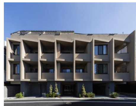
▲ Brillia ist Bunkyo Rikugien

* Some properties are not listed due to individual circumstances.