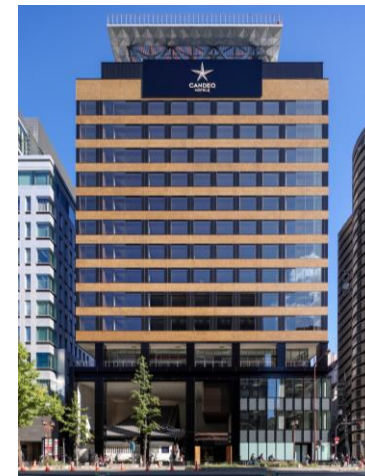
▲ CANDEO HOTELS OSAKA SHINSAIBASHI