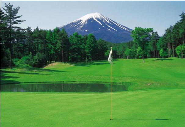
▲ Kawaguchiko Country Club