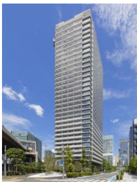
▲ Brillia Tower Hamarikyu