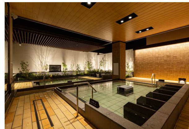
▲ Ofuro no Osama Wako