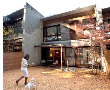
▲ Regina Resort Fuji