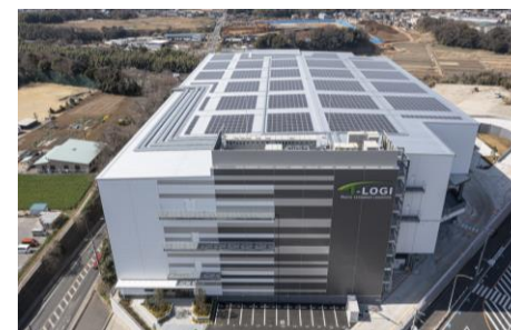
▲ T-LOGI Chiba Kita