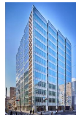
▲ T-PLUS Sendai