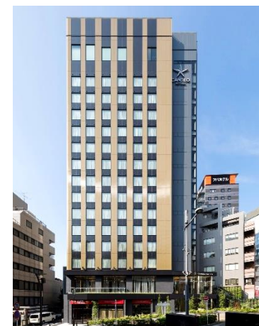
▲ CANDEO HOTELS TOKYO ROPPONGI