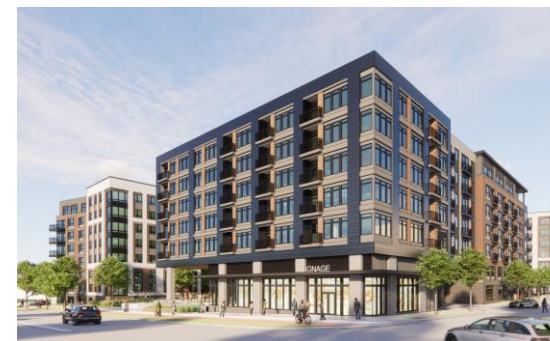
▲ Herndon Project