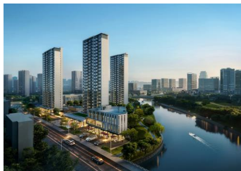
▲ Wenzhou Ouhai Project