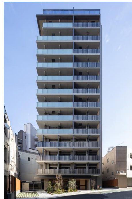
▲ Brillia ist Oimachi