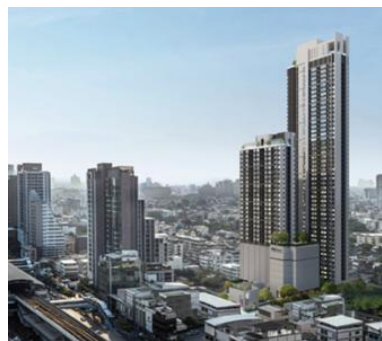
▲ Reference Project