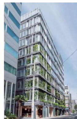
▲ T-PLUS Nihonbashi Kodemmacho