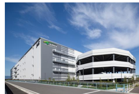
▲ T-LOGI Ichinomiya