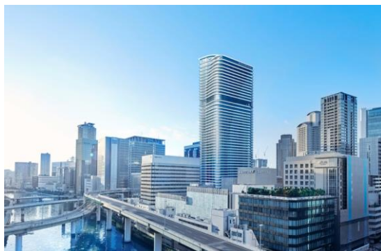
▲ Brillia Tower Dojima